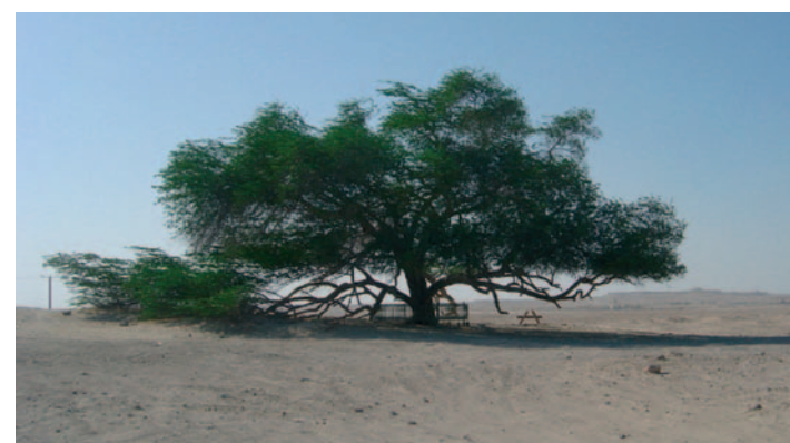
The 'Tree of Life' – flourishing in the middle of an arid desert with no obvious source of water: a symbol of Bahrain's commitment to excellence at all levels?

totalling less than 700 sq. km. of low-lying desert with some small rocky outcrops. Its population is about 700,000 of which 34% are non-nationals. In religious affiliation, 81% of the total population are Muslim, and 9% are Christian. Bahrain enjoys a relatively liberal, tolerant and open society with a low crime rate. It occupies a strategic position as a centre for trade and communication in the Arabian Gulf, its origins stretching back into prehistory. With its former abundance of fresh water springs, it was fabled as a possible site for the Garden of Eden, and described as Paradise in the Babylonian Epic of Gilgamesh. There are thousands of ancient burial mounds on the largest island, the island of Bahrain. The oldest of these dates to around 3,000 B.C. when the archipelago was known as Dilmun and was a trading centre of major importance in the Bronze Age.