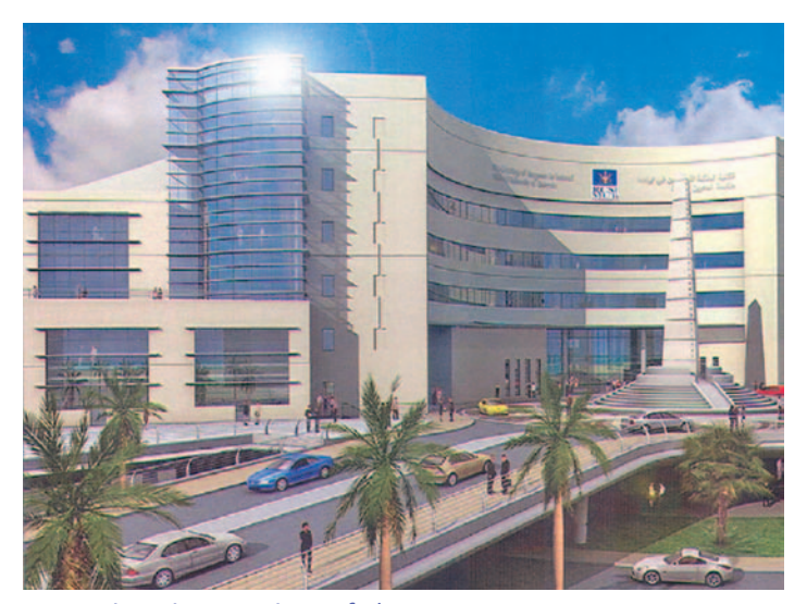
An artist's impression of the new RCSI-MUB campus

The preliminary planning for the school of dentistry envisages a course of study equal in length to that of the medical programme with a common Foundation Year including human biology; general, medicinal and pharmaceutical chemistry; medical physics; first aid; medical informatics and, for those students who require it, English. A largely common Junior Cycle of eighteen months will follow, and direct entry to the Junior Cycle will be offered to applicants with appropriate entry qualifications. It will cover the basic sciences, taught with a heavy clinical emphasis and some additional material of dental relevance. During the eighteen months Intermediate Cycle, the medical and dental programmes will diverge. The Senior Cycle will occupy the final two years of the dental programme, and will be based very largely in the dental clinics.